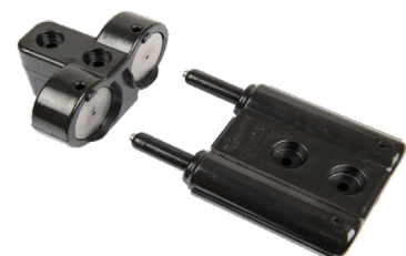
High Voltage Gate Switch