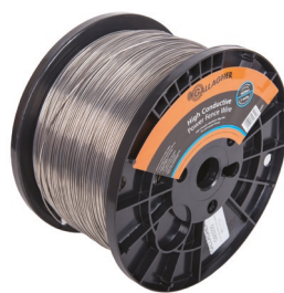
High Conductivity Wire