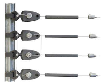
K20 Tensioner Link System